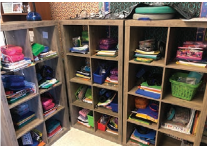
New supplies won from The Pencil Project.

the message of giving back to these classrooms and their hardworking teachers.